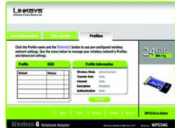
Figure 6-8: Creating a New Profile